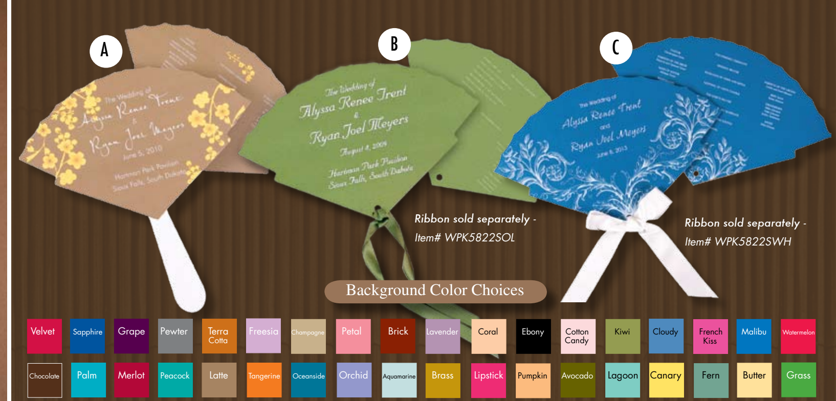
Background Color Choices Velvet Sapphire Grape Pewter Terra Cotta Freesia Champagne Petal Brick Lavender Coral Ebony Cotton Candy Kiwi Cloudy French Kiss Malibu Watermelon Chocolate Palm Merlot Peacock Latte Tangerine Oceanside Orchid Aquamarine Brass Lipstick Pumpkin Avocado Lagoon Canary Fern Butter Grass A. Scalloped Blossom - 7 1/4" X 11 1/4" Price Group B WPP421IS (unassembled) Colors Shown: Background Color 1- Latte Background Color 2 (Blossoms) - Butter Lettering: Names: PRA Copy: FUL (Front only) B. Solid Color - 7 1/4" X 11 1/4" Price Group B WPP42BBY (unassembled) Background Color Shown: Kiwi Lettering: NUP (Front only) C. Scalloped Filigree - 7 1/4" X 11 1/4" Price Group B WPP42E3Y (unassembled) Colors Shown: Background Color 1- Oceanside Background Color 2 (filigree) - Aquamarine Lettering: Names: GRM Copy: AGD (Front only) Important Note for All 3 Fans above: •Lettering Style on back: Only as shown •White Imprint Available Only as Shown •Ribbon sold separately. •Background color options shown above.