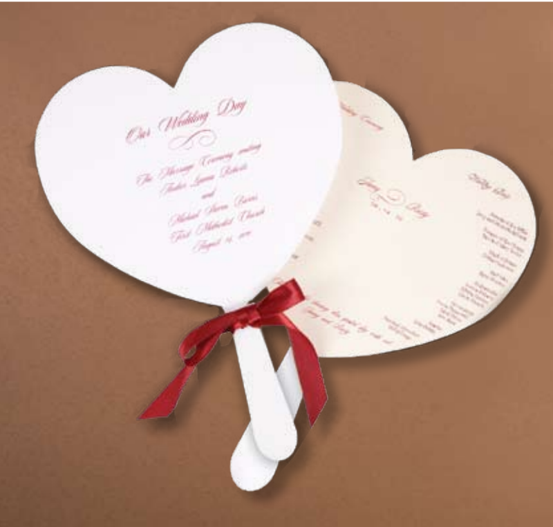
Heart Fan Program - 8" X 7 1/2" Die Cut Price Group B Bright White: WPPN1010 - (unassembled) Ecru: WPPN1011 - (unassembled) Lettering Style: SLP Motif (Front): 3460MF Monogram (Back): P-121 Ink: Bordeaux Ribbon sold separately - Item# WPK5822SSL