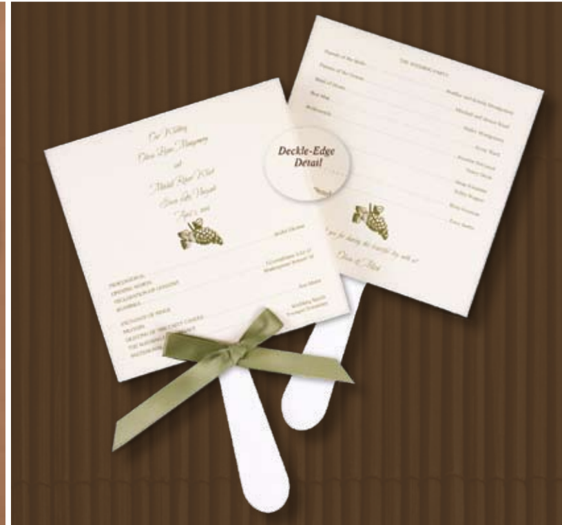
Ecru Pearl Deckle-Edge Fan Program - 6 1/4" X 6 1/4" Price Group A WPPN2524 (unassembled) Ink: Olive Lettering Style: AVA Motif: GRP Ribbon sold separately - Item# WPK5822SOL