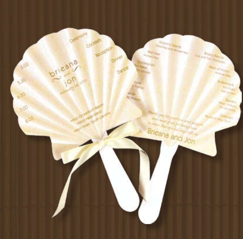
Shell Fan Program - 6 3/4" X 6 1/4" Die Cut Price Group B WPPN1010SHL (unassembled) Ink: Gold Monogram: M-276 Lettering Style: KBL Ribbon sold separately - Item# WPK5822SAW