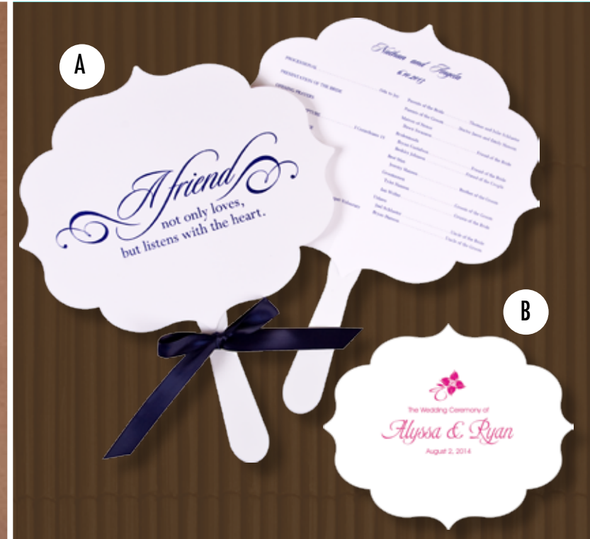
A. Flourish Fan - 10"x 10" Price Group B WPPN1010CRA (unassembled) Ink: Navy Front: Only as Shown Lettering Style: SLP Ribbon sold separately - Item# WPK5822SNV B. Flourish Fan - 10"x 10" Price Group B WPPN1010CRB (unassembled) Ink: Fuchsia Lettering Style: Names: MRN Front Copy: AGD