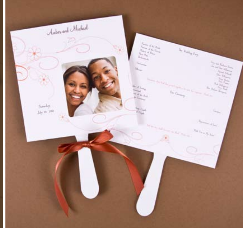
Full-Color Square Program Fan - 7"x 7" Price Group B WPPN42E3K (unassembled) Imprint: Chocolate & Tangerine (See solid color Scalloped Fan Program Color Chart at left for imprint color choices.) Lettering Style: Names: MOP Copy: SAR Photo will be printed exactly as submitted. Ribbon sold separately - Item# WPK5822SGN