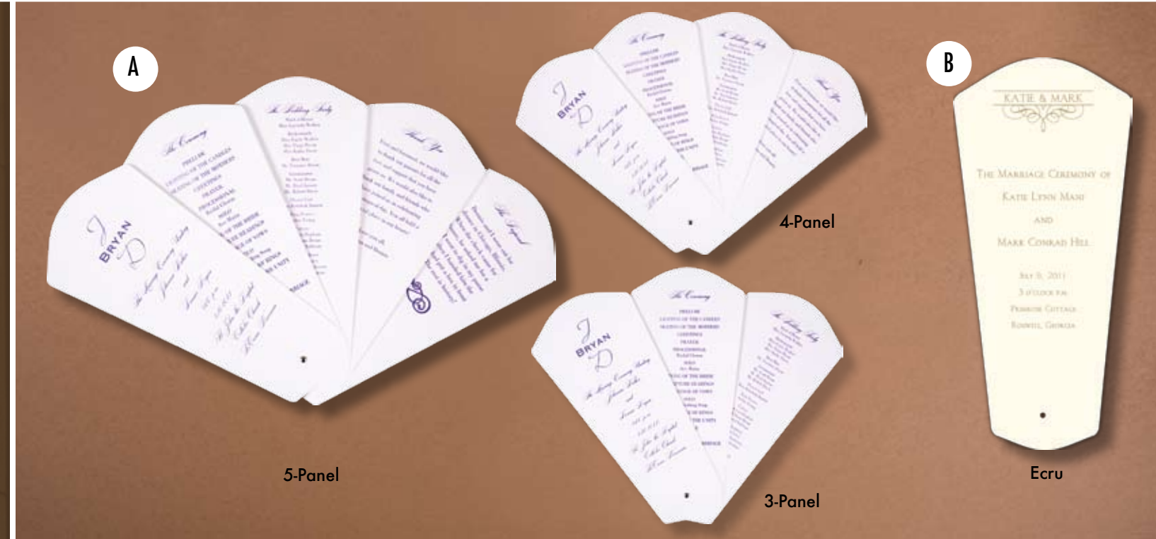
A. White Peacock Fan Price Group C Monogram: M-36 Ink: Violet Titles: RKS Copy: BOD The Peacock Fan Program - Each Panel 4" x 8 3/4" 3-Panel, 4-Panel and 5-Panel Available (Fans will arrive unassembled) Fasteners/Brads and Pearl adhesives sold separately - see side panel. A. White B. Ecru 3-Panel: WP1082T WP1078T 4-Panel: WP1082F WP1078F 5-Panel: WP1082V WP1078V Note: Peacock layout only as shown. Motif is increased in size on front panel only. You may choose types for front panel and remaining panel headers only. (i.e. The Ceremony, The Wedding Party, etc.) B. Ecru Peacock Fan Price Group C Monogram: M-310 Ink: Almond Front Copy: LCR