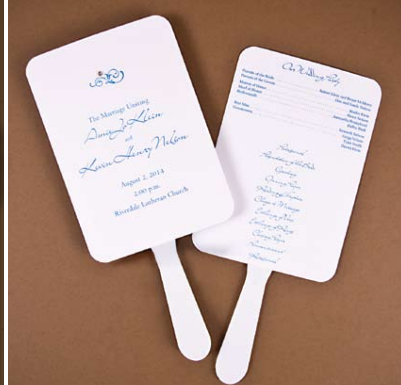
Rounded Corner Petite Fan Program - 5" X 6 1/2" Price Group A WPPN7828 (unassembled) Ink: Marine Lettering Style: Names & Headings: MRL Copy: VTN Motif: 4267MF Rhinestones sold separately.